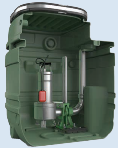
Automatic pump installation Type BG1000