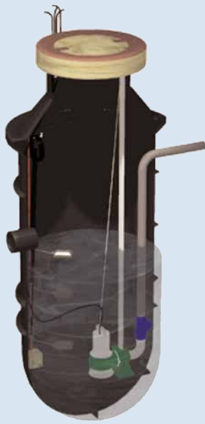
HDPE pump installation Type PEV1000