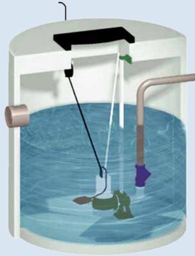
Concrete pump installation Type P1000