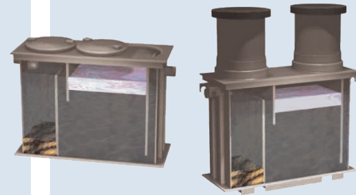
HDPE Separator Available in both oil as grease separator